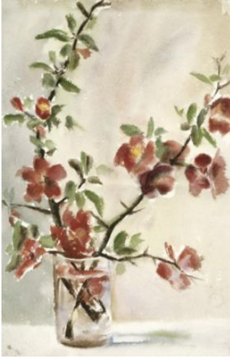
Georgia painted this at just 6 years old.